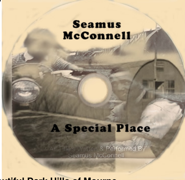
Beautiful Dark Hills of Mourne